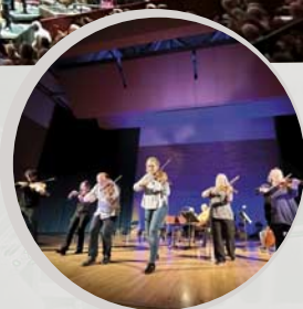
Musicians in rehearsal for Scherzi musicali

Early Music Reviews, July 2023 Beethoven and Mendelssohn